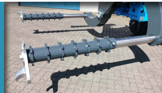
Telescopic pipes for long reach

Hydraulic functions can easily be integrated with existing crane control system