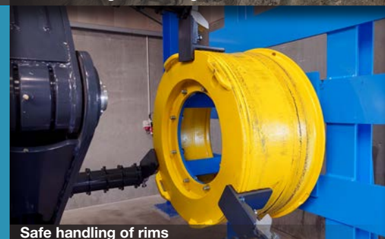
Safe handling of rims