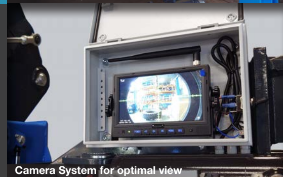
Camera System for optimal view