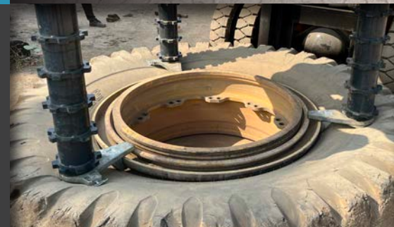
Safe handling of side rings and bead seat bands