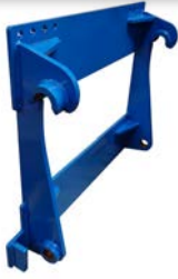
Interface for carrier specific attachment