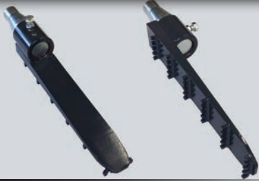
Flat top arm for limited tyre clearance