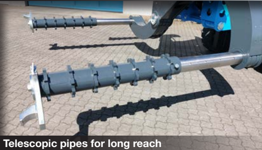
Telescopic pipes for long reach