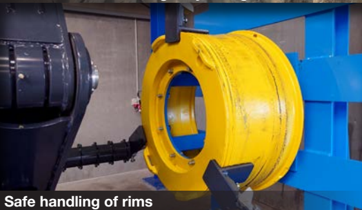
Safe handling of rims