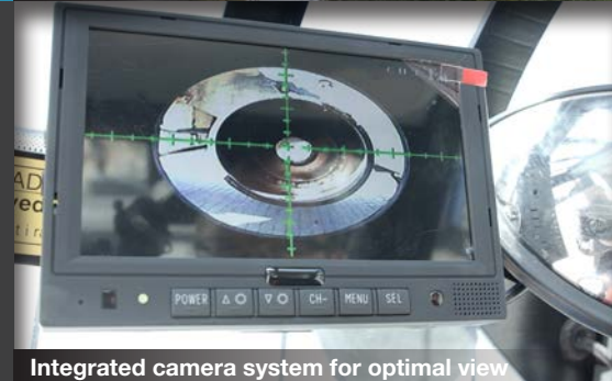
Integrated camera system for optimal view