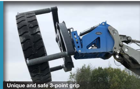
Unique and safe 3-point grip