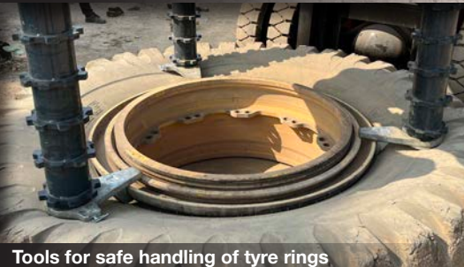
Tools for safe handling of tyre rings